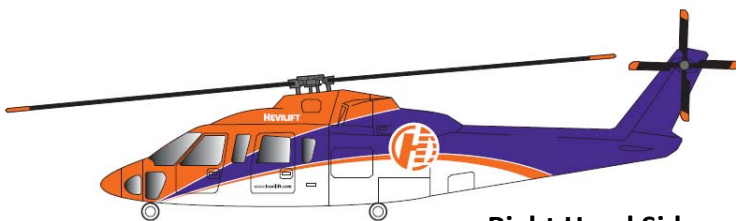
Right Hand Side