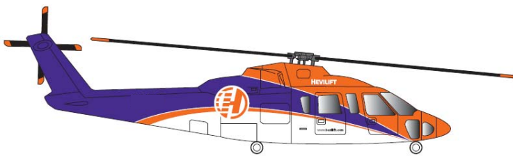
Left Hand Side

The Sikorsky S-76 is an American medium-size commercial utility helicopter, manufactured by the Sikorsky Aircraft Corporation. The S-76 features twin turboshaft engines, four-bladed main and tail rotors and retractable landing gear. Updated with Turbomeca Arriel 2S2 .